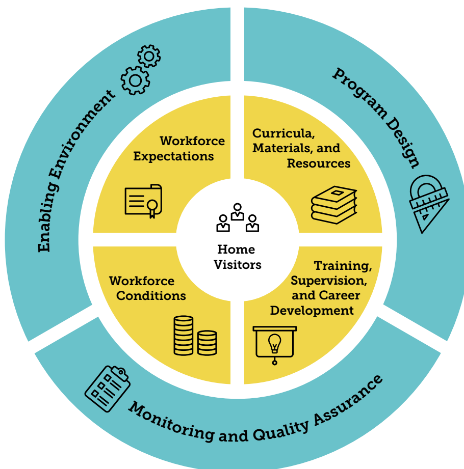
▼ Figure 1: Supporting and Strengthening the Home Visiting Workforce

All Areas are interconnected and vital for strengthening home visiting personnel and the quality of programs overall. The first four Tool Areas impact the work of home visitors on a day to day basis (the inner circle), while the final three Tool Areas reflect what is needed at the system-level to support service delivery (the outer circle).