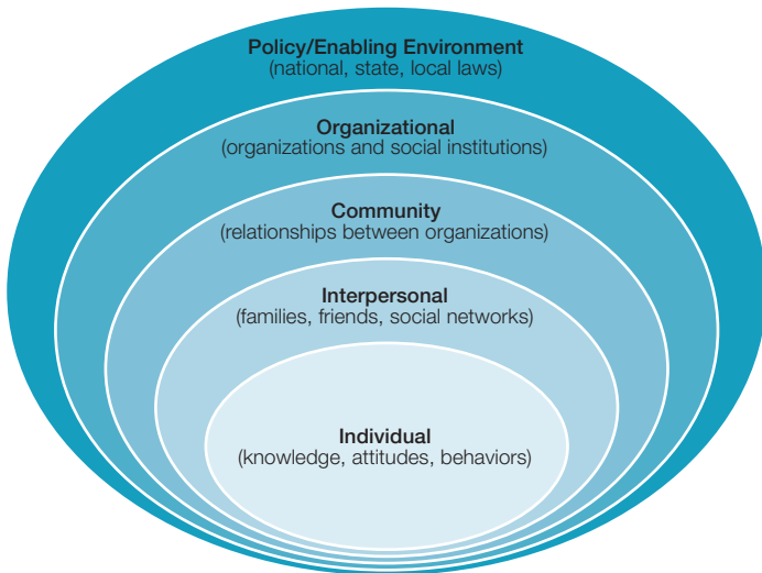
Figure 1. The Social-Ecological Model